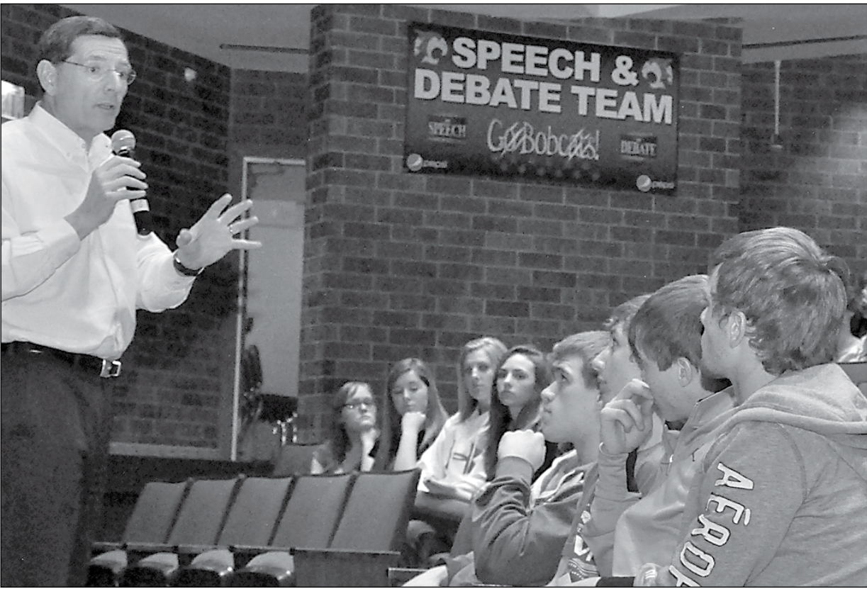
U.S. Sen. John Barrasso addresses Hot Springs County High School students on Feb. 19 in the school auditorium. Barrasso fielded questions from the teens, which ranged from his stance on the Affordable Care Act and marijuana legalization to a proposed raise of the federal minimum wage. “They had some great questions,” Barrasso said after the Q-and-A.