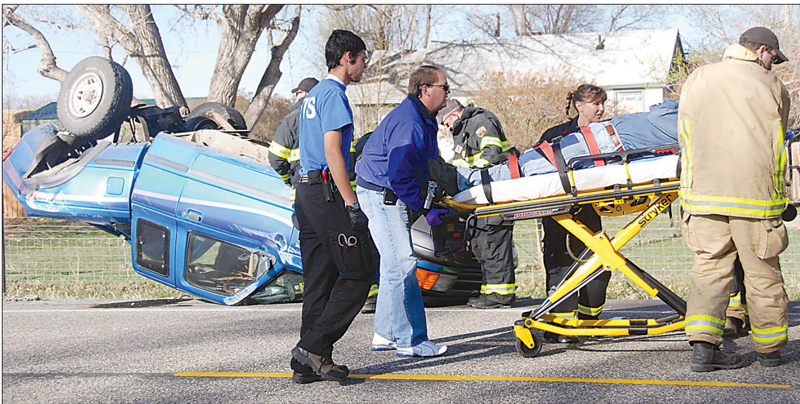
EMTs and firefighters responded to a rear-end crash at about 8:30 a.m. Tuesday near Nakamura Lane on Highway 20 North. Both occupants of the first vehicle

were taken to Hot Springs County Memorial Hospital. One was later Life Flighted. A full report on the crash was unavailable at press time.